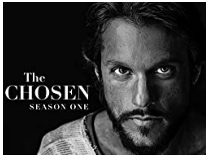
The Chosen: Season 1 Click here to watch!

If you haven't yet watched The Chosen, make it a point to do so! I usually find Christian movies to be somewhat boring and difficult to get into. But not this one. It's fun to watch, the characters are well developed, and the people act like, well, people!