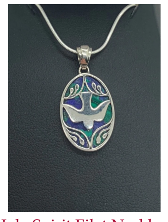
Holy Spirit Eilat Necklace